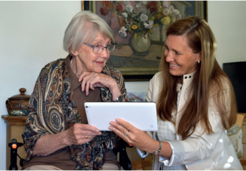
Internet training for older people in their homes