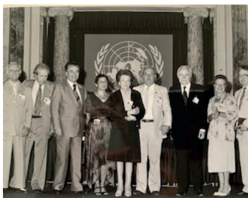
BAGSO Honorary Chairwoman Prof Dr Ursula Lehr (second from right) with international representatives of gerontology in Vienna, 1982

The year 2022 will mark the 20th anniversary of the United Nations Madrid International Plan of Action on Ageing (short MIPAA 2 ). To this day, it provides a policy framework and a comprehensive action plan for governments and civil society. MIPAA is an international response to the opportunities and challenges of the ageing world population and aims to develop a society for all ages.