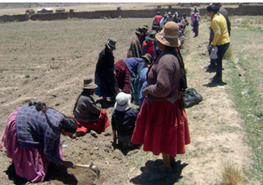
Older people planting trees together with children in Peru

To this day, MIPAA is recognised as the first important international document to address ageing issues in the context of human rights. The political declaration of the member states reaffirms the commitment to the protection and promotion of all human rights and fundamental freedoms, including the right to development. This new trend coincided with a general paradigm shift away from a needs-based approach and towards a human rights-based approach in development cooperation.