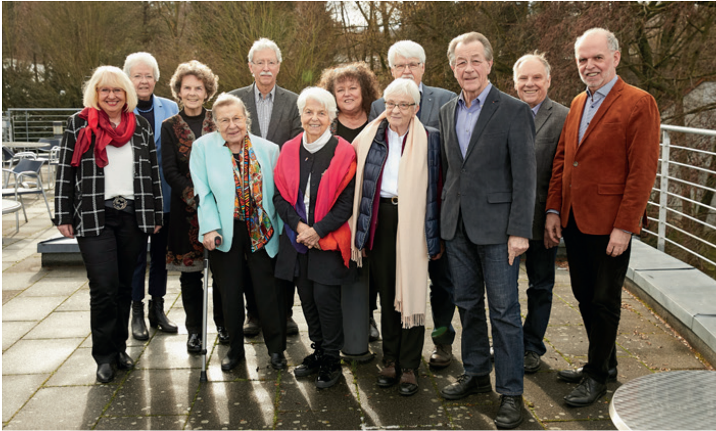
BAGSO Board of Directors

Since 2016, BAGSO is actively participating in the sessions of the Open-ended Working Group on Ageing (OEWG-A) in New York as a representative of civil society. Written inputs are submitted to the United Nations in preparation for the sessions and statements on the session topics are developed.