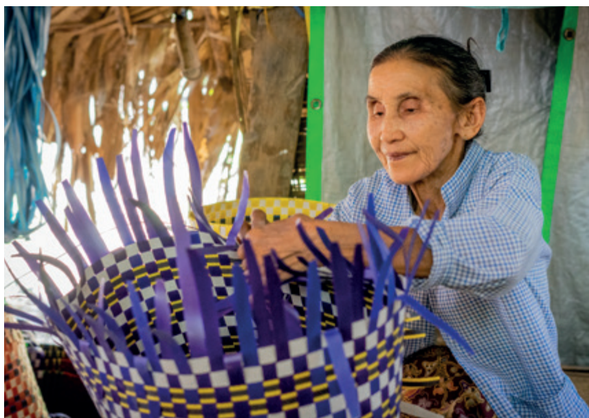
An older woman weaving baskets in Myanmar

Since civil society assessment is an integral part of the review, many governments involve senior citizens' organisations and other stakeholders in the review of the MIPAA implementation at national level, as is the case in Germany. In some countries, such as Brazil and Chile, senior citizens' advisory councils, national forums and conferences as well as public consultations have been established to improve the participation of older people.