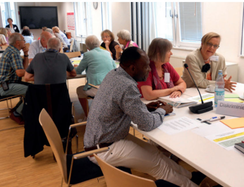
Symposium of the Secretariat for International Policy on Ageing, June 2017

In the UNECE region, the number of reporting countries has increased from cycle to cycle. In the third review cycle (2017), 84 per cent of member states (compared to 67 per cent in the second cycle, 2012) submitted a report. In addition, growing interest arose among member states in creating ageing policies that are based on MIPAA and the RIS, e.g. when it comes to developing strategies with the support of the UNECE Population Unit. In this respect, for example, Armenia, Belarus, Georgia and Moldova have been supported in the preparation of road maps.