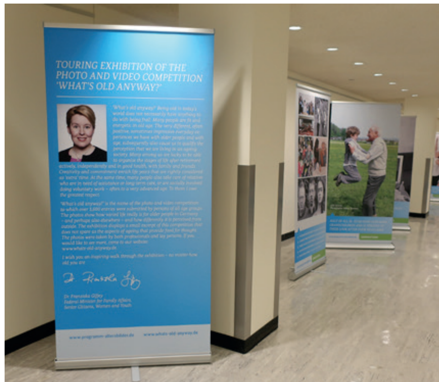
Touring exhibition "What's 'old' anyway?"