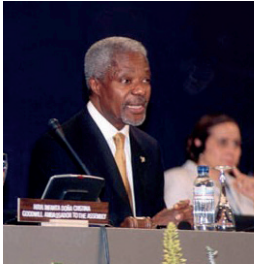
UN Secretary General Kofi Annan during his opening speech in Madrid in 2002

As a result, the United Nations decided in 2000 that a Second World Assembly should be held two years later. The Assembly and the draft plan were prepared over the next two years by the United Nations, member states, civil society and the scientific community.