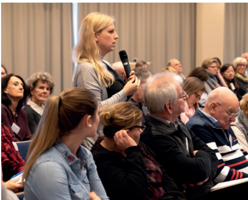
BAGSO symposium “Shaping a future for our grandchildren: Older generations and the 2030 Global Agenda”

According to the Independent Expert, a binding regulation at UN level could help raise awareness of the issue of ageing and older people and commit UN member states to regular reporting and increased action. Experience with other international human rights conventions has shown that legally binding instruments are more likely to succeed 11 . While such a convention would be of minor importance for many developed countries because of already existing laws, it would nevertheless be crucial for less developed countries – not only