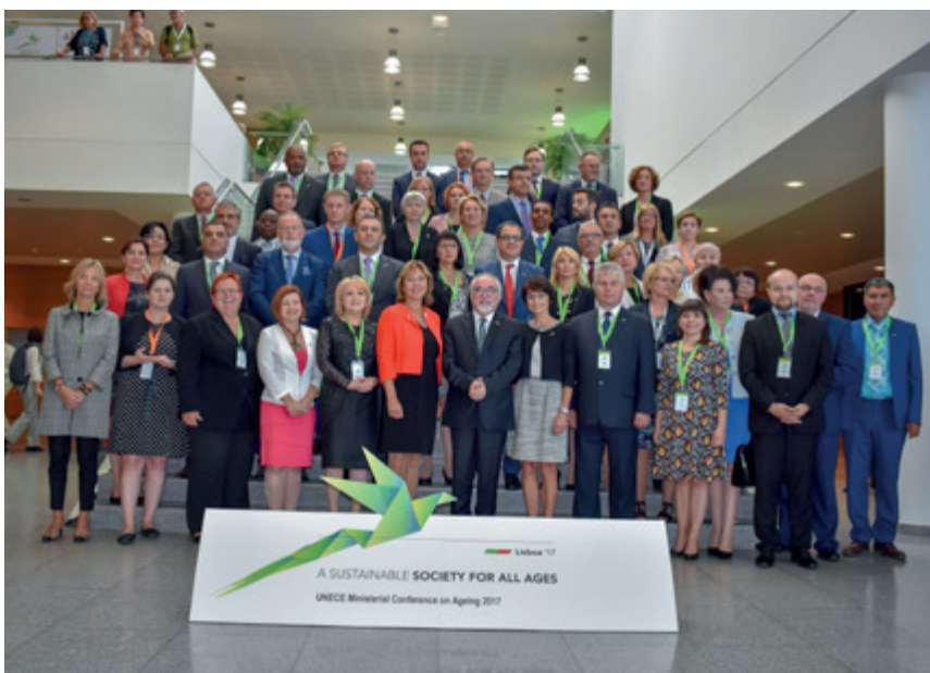
UNECE Ministerial Conference in Lisbon, 2017