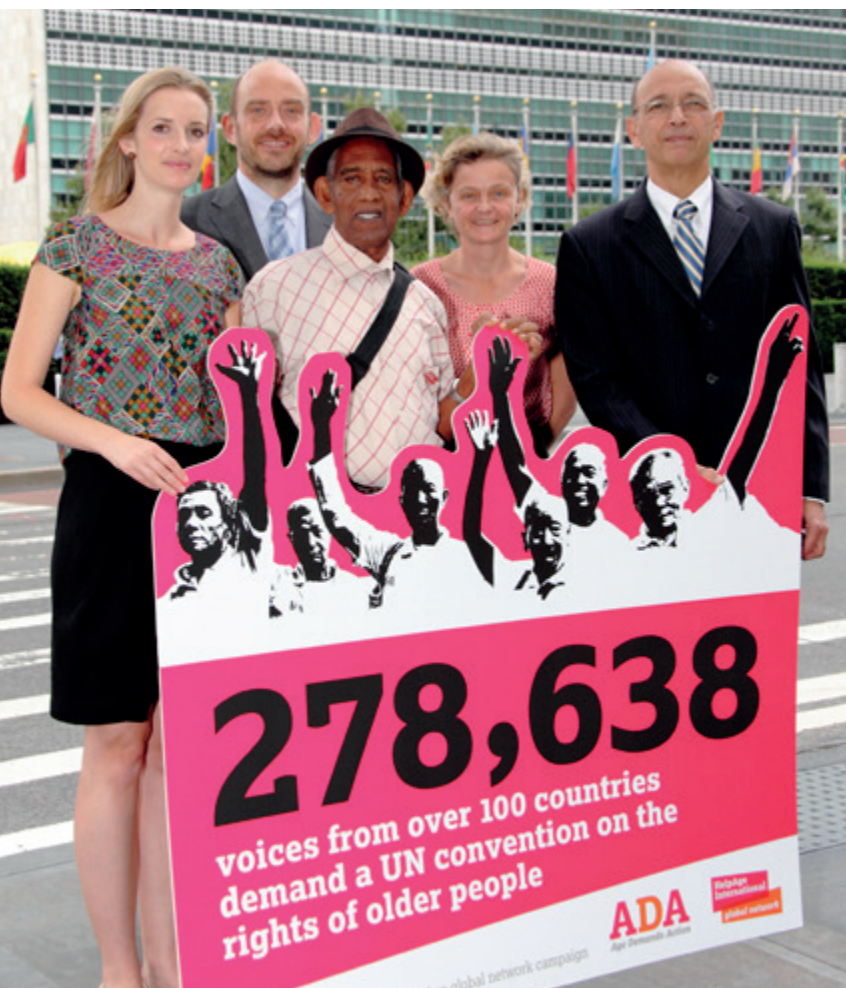
Petition for a UN convention on the rights of older people

Today, it is generally agreed that MIPAA has put ageing and continuing demographic change on the international agenda. Yet although great progress has been made, the UN has noted in recent years that significant implementation gaps still need to be closed. In its reports, the UN has identified key barriers that have to be overcome in order to push the implementation of MIPAA.